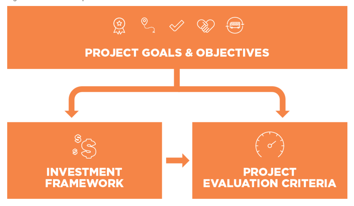
Figure 4-1 Relationship of Transit Investment Framework to Other Transit Vision Elements

The framework consists of two categories: Service Allocation Guidelines and Capital Investment Guidelines. The complete Transit Investment Framework is available in Appendix C.